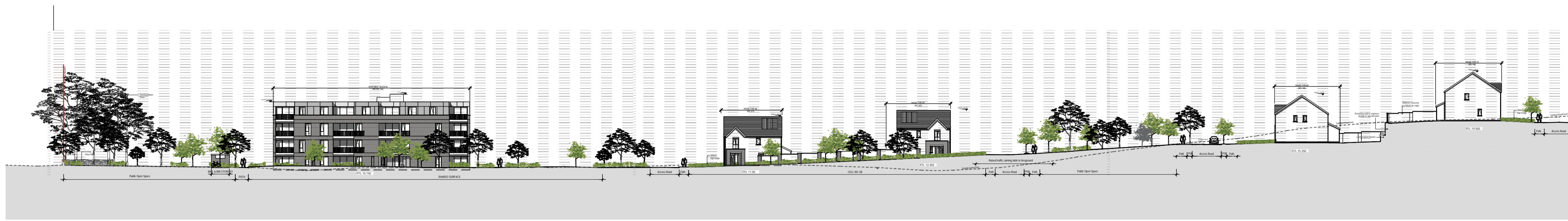
01 Site Context Elevation B-B Scale: 1:500