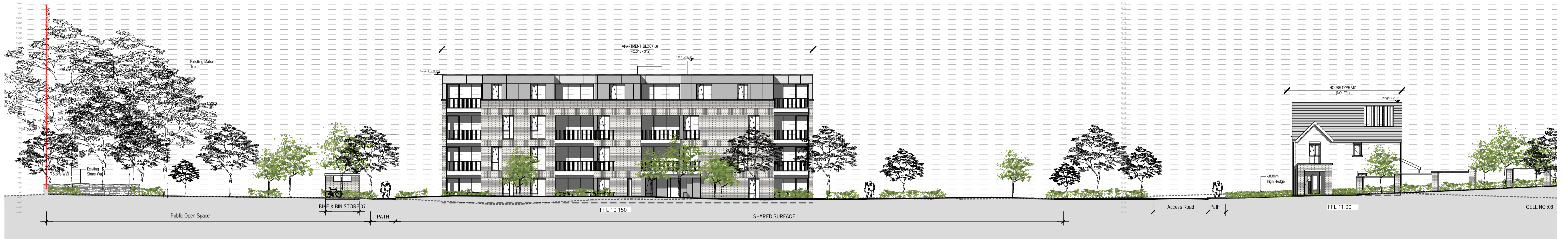
02 Site Context Elevation B-B PART 1 Scale: 1:200